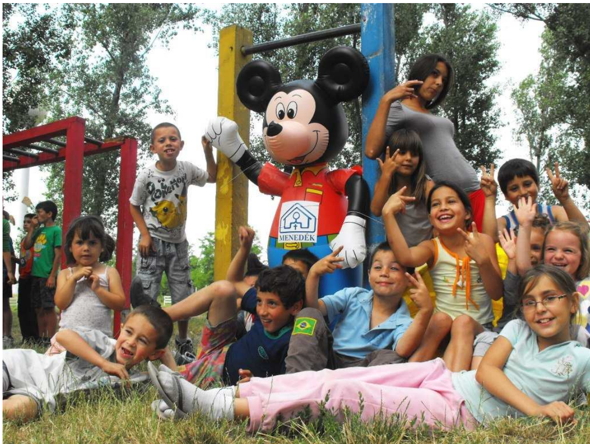
Children from Kiskunmajsa